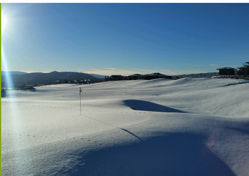
Snow Day on the Course

For an in-depth 12 week workout plan CLICK HERE and get in the best golf shape for 2019.